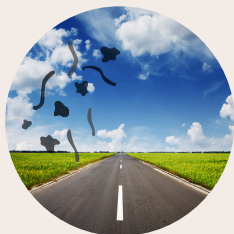
Many new floaters or spots in vision.

Have you suddenly got one or more of these symptoms? Call your general practitioner or consult an optometrist immediately. If it is evening or the weekend, contact the 24/7 medical service. Do not wait until the next working day. Act quickly to prevent permanent damage to your vision!