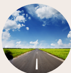
Fixed spot at the edge