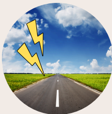
Flashes of light