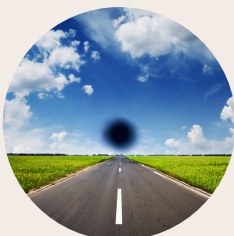
Fixed spot(s) in the center of vision